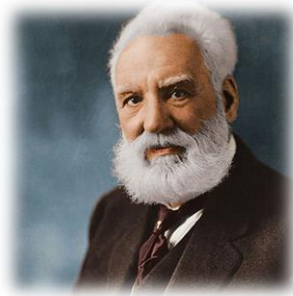
Alexander Graham Bell